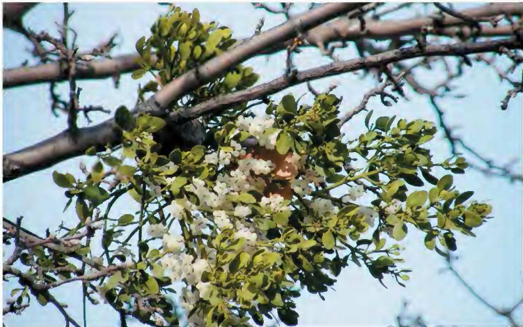
FIG. 2. Pistillate clump of American mistletoe ( Phoradendron leucarpum ssp. leucarpum ) in Callery pear ( Pyrus calleryana ).